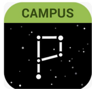
Infinite Campus Parent Portal

Schedule, Calendar, Grades, Report cards